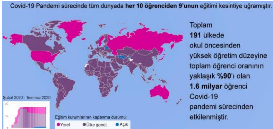
Figure 2. Countries where education is suspended due to the Covid-19 pandemic (UNESCO, 2020b)

In addition to this, curfew practices are also included in increasing the measures taken. The quarantine process is supported by the reduction of touch points. Face-to-face education was suspended on the condition of increasing social distance rules and continuing from pre-school to higher education level (Bozkurt et al., 2020; Bozkurt & Sharma, 2020; Doghonadze et al., 2020; Gupta & Goplani, 2020). With the interruption of education, it is seen that 1.6 billion students in the world are interrupted in the field of education (see Figure 1) (UNESCO, 2020a; UNICEF, 2020).